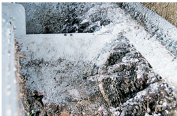
Ultra-Urban Filters near the Santa Monica Pier capture sediment and debris but still allow a large amount of water to flow through.

In 2004, the Long Beach City Council unanimously approved a contract of up to $1 million for installing and monitoring AbTech's Ultra-Urban Filter series with Smart Sponge Plus antimicrobial technology. According to Leary, the filtration systems are flexible: "The filters can be installed very quickly. If we find they are needed more critically in a different area, we can easily relocate them. After the filters reach saturation, they can simply be replaced. Fortunately, I am told that they are fully recyclable, and they will not add to the toxic waste problem," he adds.