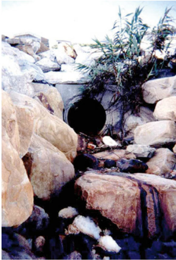
A storm drain outfall pipe near Santa Monica empties runoff directly onto the beach.

Staphylococcus aureus , E. coli , and fecal coliforms.